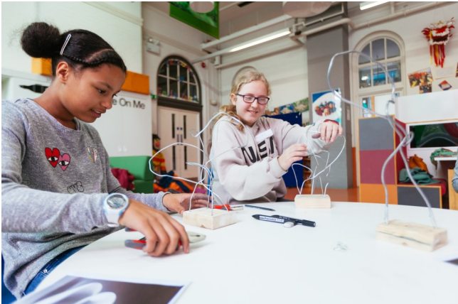
Future Creatives - Tonbridge - 7 to 11 year olds | UAL

Future Creatives after school art and design classes in Tonbridge and Tunbridge Wells give pupils the opportunity to access their creativity in a way that goes beyond typical classroom learning. Over the 6 weeks that the courses run, they will explore various art and design projects that bring together new creative skills, techniques and concepts.