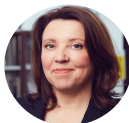
Dame Rachel de Souza

This survey will only take you 5-10 minutes .