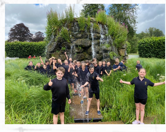
YFAR 6 - BOLLIFS