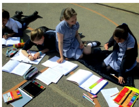
ENGLISH LESSON IN YEAR 5