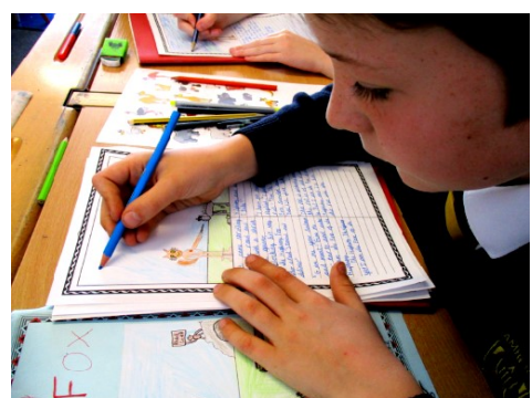
A SPOT OF READING IN YEAR 4