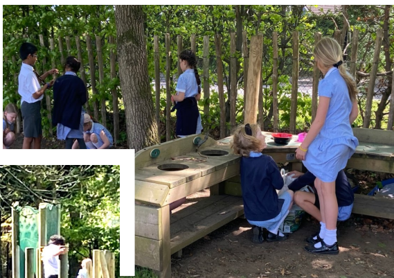
CELERY EXPERIMENT IN YEAR 3