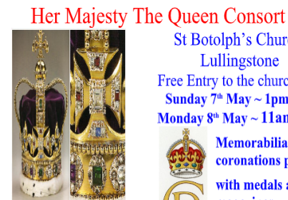
Sunday service: 11am BCP Morning Prayer, in joyful celebration of the coronation of KING CHARLES III followed by a bring-and-share picnic

The Coronation of His Majesty King Charles III