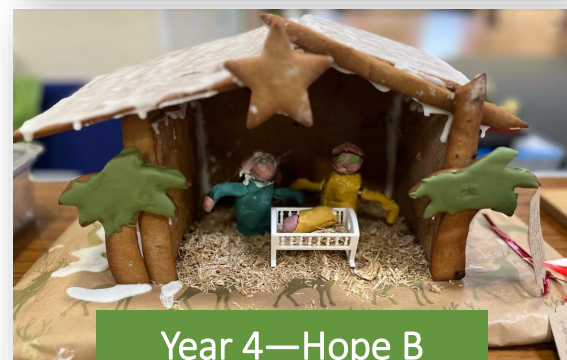
Year 4—Hope B