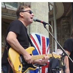
SQUEEZE A CROWD