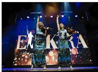
ELEKTRA VIOLIN DUO