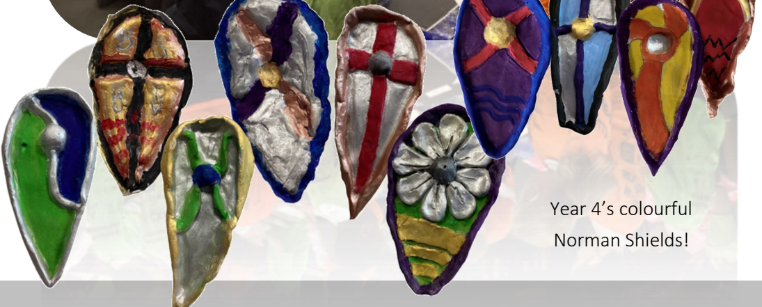
Year 4's colourful Norman Shields!