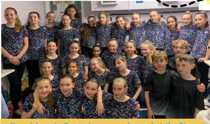
...Year 6 Love to Dance troupe performed at the Stag.