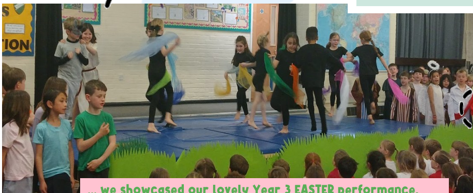
... we showcased our lovely Year 3 EASTER performance,