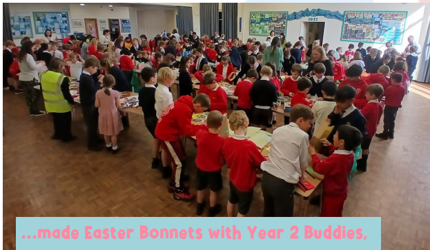
...made Easter Bonnets with Year 2 Buddies.