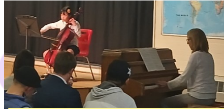
...hosted the Amherst Music Festival.