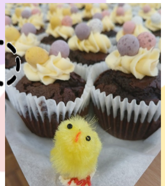
...and were treated to the most amazing EASTER cupcakes by our lovely kitchen!